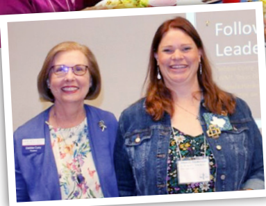
▲ Women enjoy lunch and fellowship.