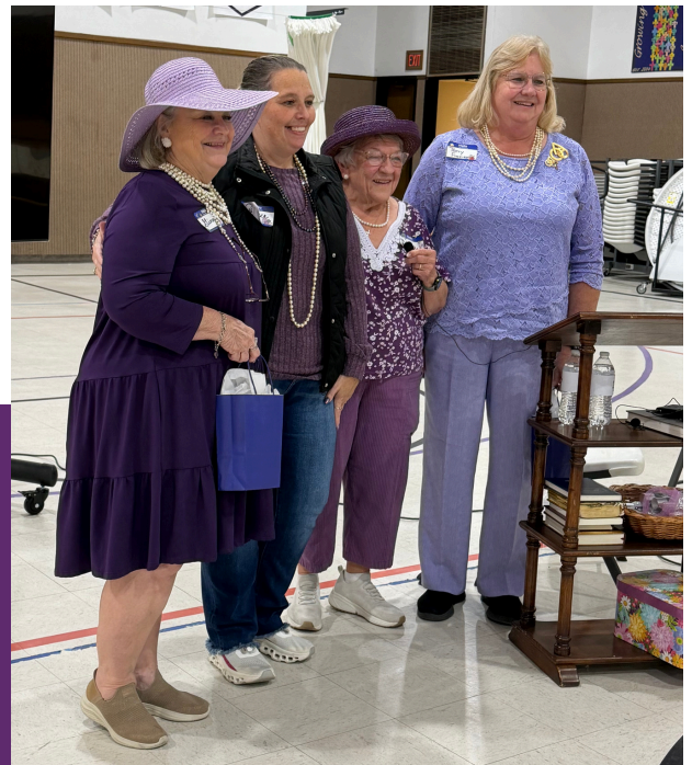
Pictured are the winners of the "Wear Purple and Pearls" contest! Who knew there were so many shades of purple!