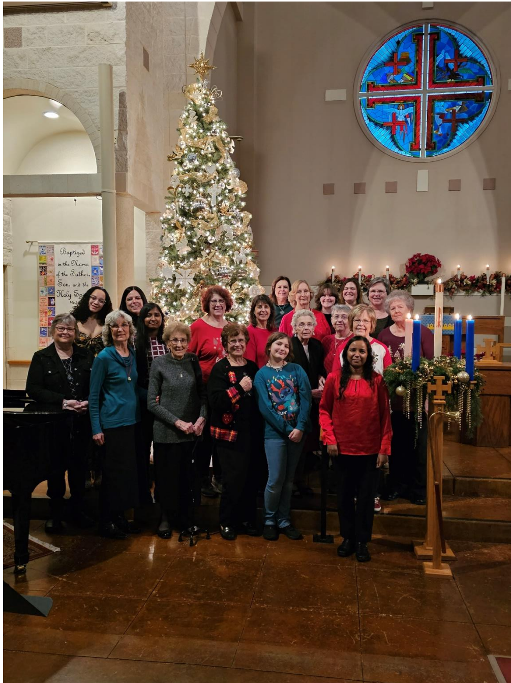
Our Savior Women's Guild