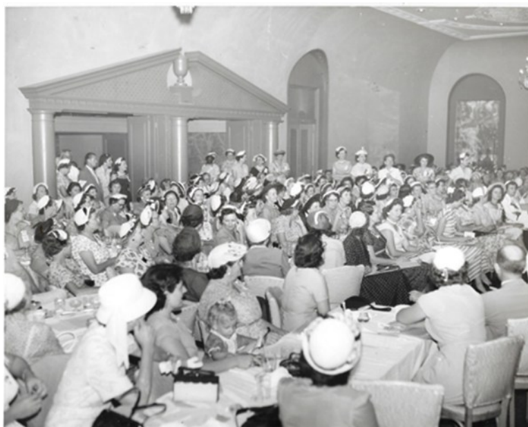
1st TX District Convention Waco, TX 1954