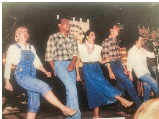
TX District Convention 1990