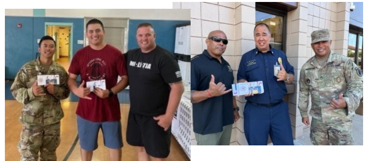
Bible Brigade, Lutheran Disaster Care