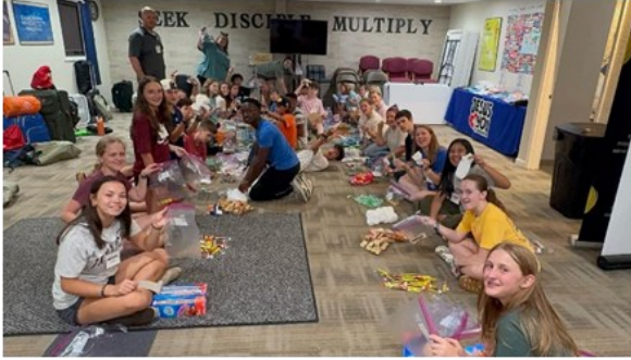
Mission team from Tyler, Texas assembling care packages for community outreach