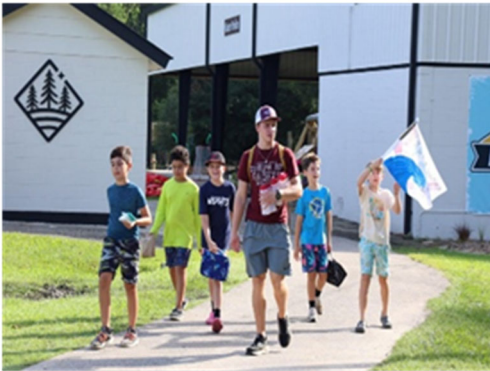
Day campers enjoy recreational games, crafts, and fellowship in a Christ-centered environment.

Camp Lone Star praises God for the work He is doing through their leaders, staff, and ministry partners—and they are especially thankful for the LWML's partnership in bringing this impactful ministry to life. Thank you for believing in their mission and helping them share the love of Christ with even more children and families.